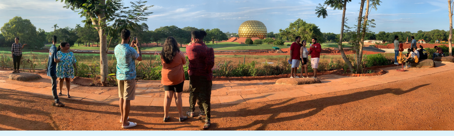
The view from the new public viewing point

plants and grass on the 20 acres of Park of Unity. There are plumbers, electricians and metal workers, accountants and stock keepers, - all part of a smoothly functioning whole. It is a vast site, with a coordinated dance of teams of people attending to the multitude of tasks needed to maintain the site in all its beauty and to move forward with the construction of new features, be those the gardens, the oval road, the lake